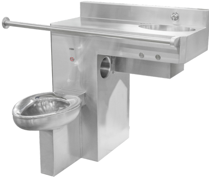
Fixture maybe featured with available options.